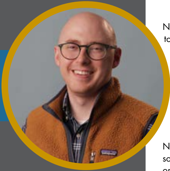
SBCC Support Team IT Specialist, SBCC