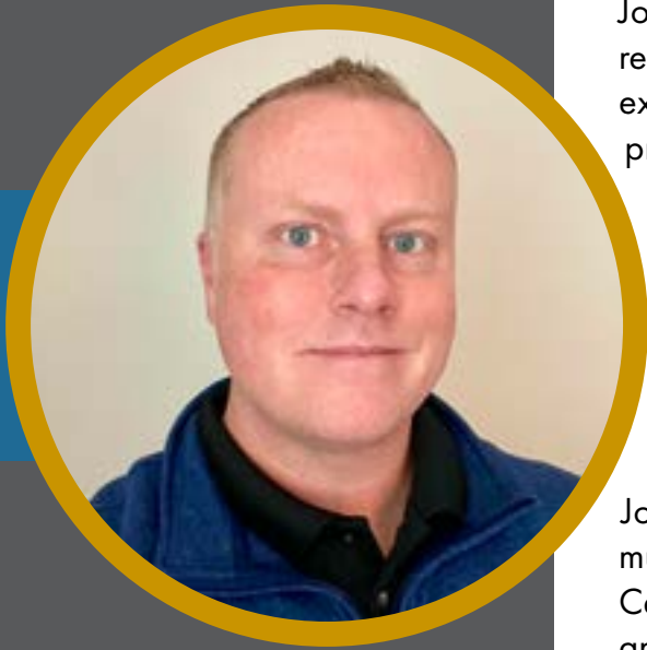
Presenter & Moderator CMSgt, USAF (retired)