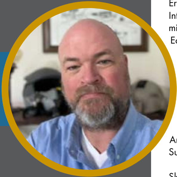
Presenter & Moderator CMSgt, USAF (retired)