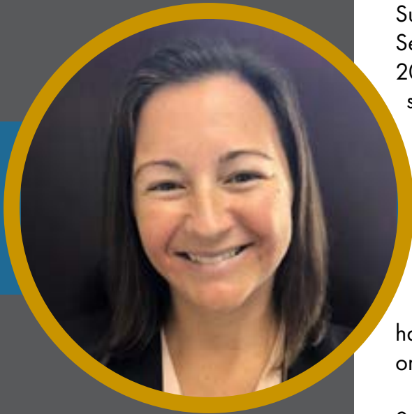
Presenter & Moderator CMSgt, USAF (retired)