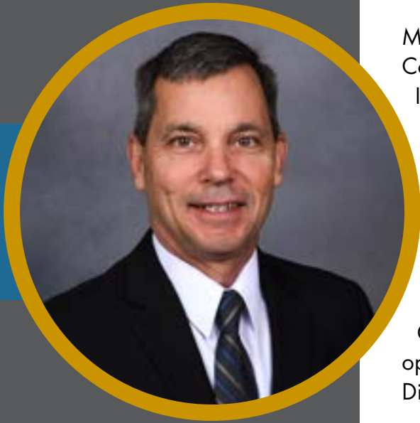
Presenter & Moderator Col, USAF (retired)